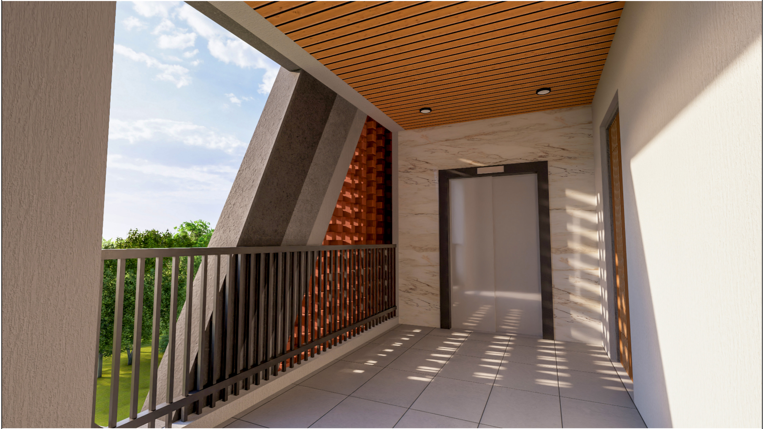
3RD FLOOR ENTRANCE VIEW