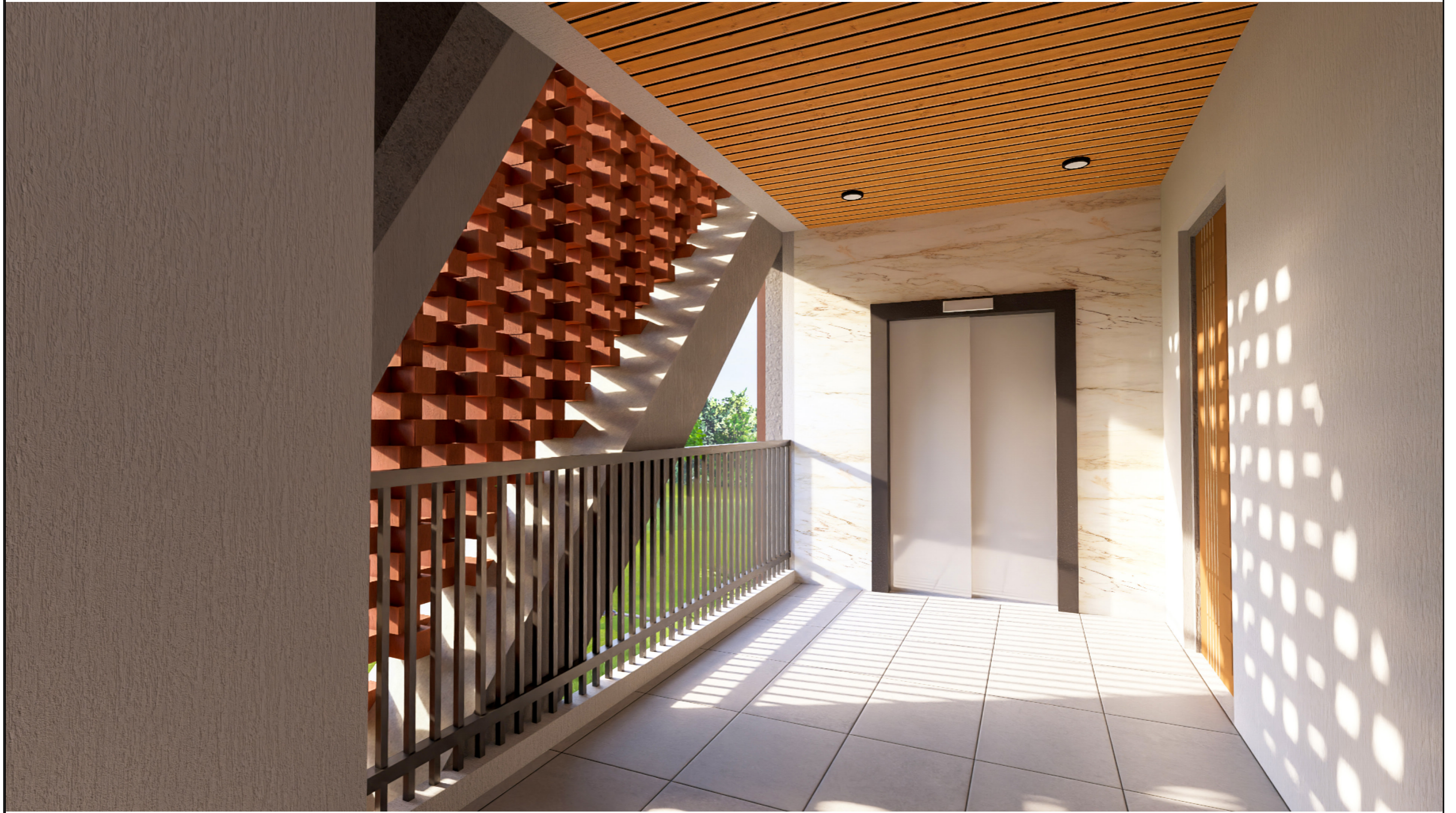
2ND FLOOR ENTRANCE VIEW