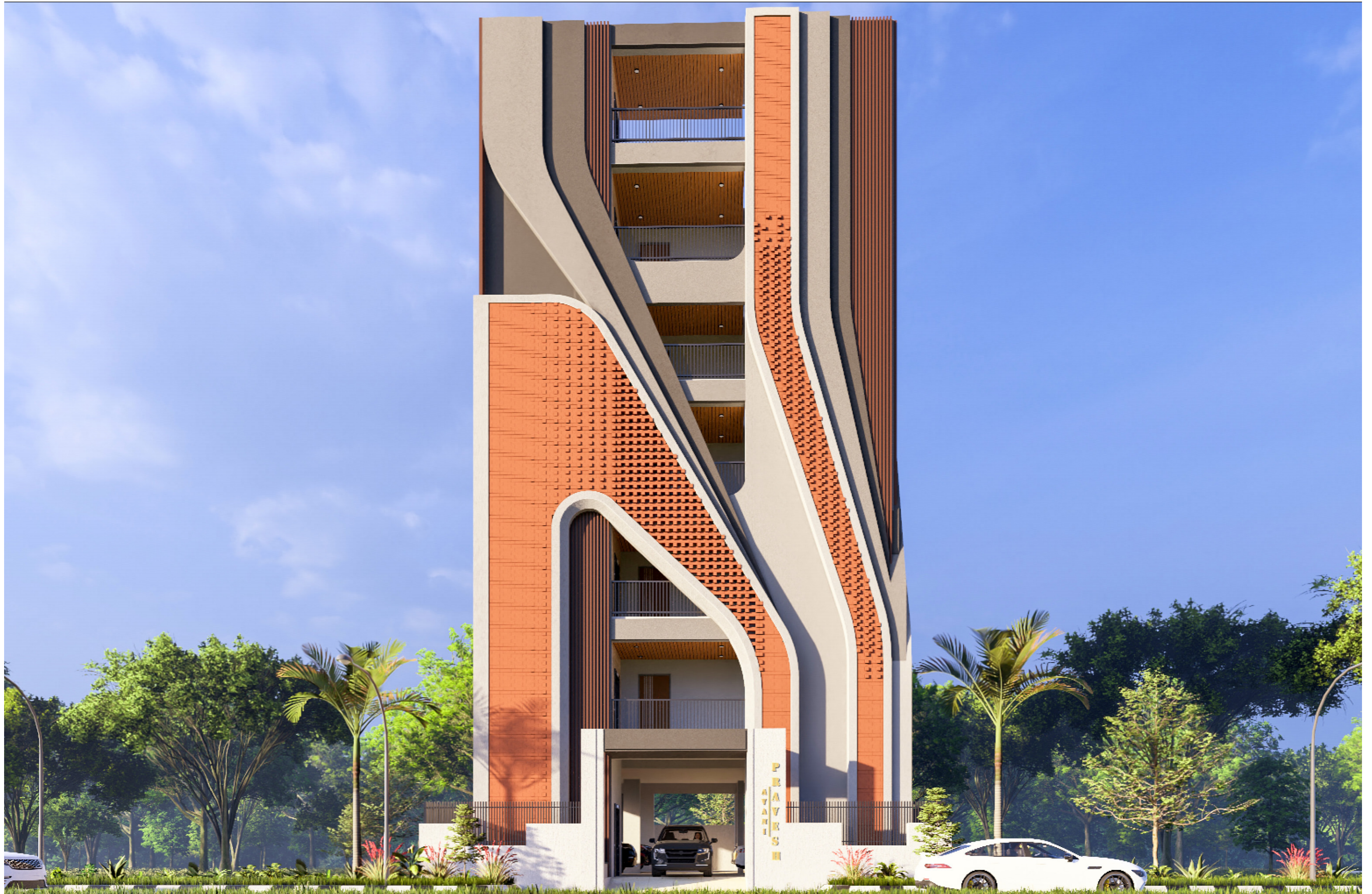
FRONT ELEVATION OPTION 2